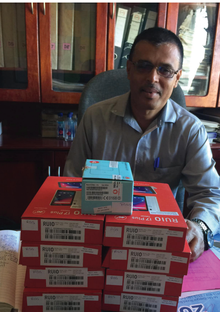
TECHNOLOGY HANDOVER TO RAVIRAVI SANGAM SCHOOL. TABLETS AND WIFI FOR BUILDING CAPACITY OF STUDENTS AND RAVIRAVI COMMUNITY. VODAFONE CONTINUES TO EMPOWER AND EDUCATE PEOPLE WITH LATEST TECHNOLOGIES .