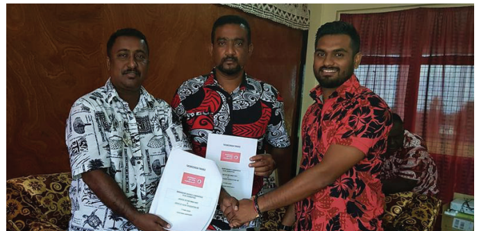
The BA METHODIST SCHOOL, a boarding school that houses students from Nauru, Tuvalu and other Pacific Island countries. According to Principal Food security is a real issue and the current fees is only able to cater for 74 cents per meal. Nutritional benefit to students is a challenge. They have land area where now planting is being done. The $2.5k grant from the Foundation will be invested into the farm to ensure sustainable food supply.