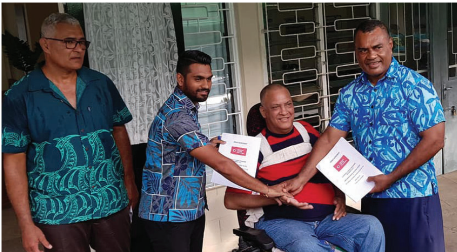
$10,000 FOR DISABILITY SERVICES: Viti Spinal Injury Association of Fiji receiving $10k grant for boosting mobility device accessibility and services to the communities