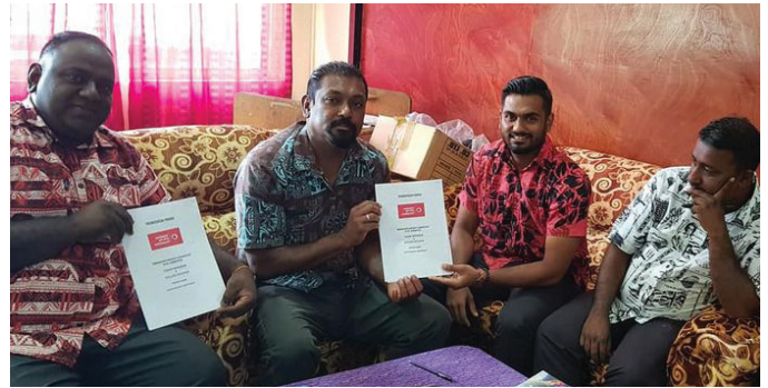
NUKULOA COLLEGE Bee Keeping project grant signing in Ba with Western Charity Alliance.