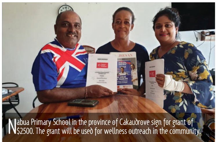
N abua Primary School in the province of Cakaudrove sign for grant of $2500. The grant will be used for wellness outreach in the community.