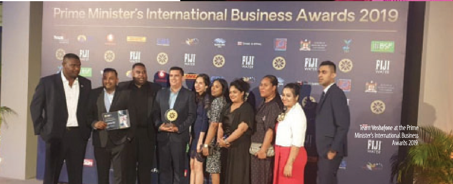
Team Vodafone at the Prime Minister's International Business Awards 2019.