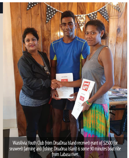
Waisiliva Youth Club from DruaDrua Island received grant of $2500 for seaweed farming and fishing. DruaDrua Island is some 90 minutes boat ride from Labasa river.