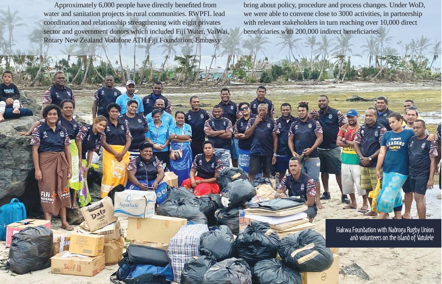
Hakwa Foundation with Nadroga Rugby Union and volunteers on the island of Vatulele

Under the World of Difference (WoD), the Foundation continues to mentor the candidates and its charity partners to bring about policy, procedure and process changes. Under WoD, we were able to convene close to 3000 activities, in partnership with relevant stakeholders in turn reaching over 10,000 direct beneficiaries with 200,000 indirect beneficiaries.