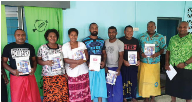
NAVUTULEVU YOUTH CLUB Bee Keeping project grant signing at Rakiraki Village in the RaProvince.

Our Sustainable Funding programme strives to promote the health, wellbeing, and capabilities of young people in Fiji, with a focus on building social leadership capacities. Projects ranged from providing potable water in villages, homes for destitute, assistance to schools, training and guidance to youth, micro-enterprises and healthy living.