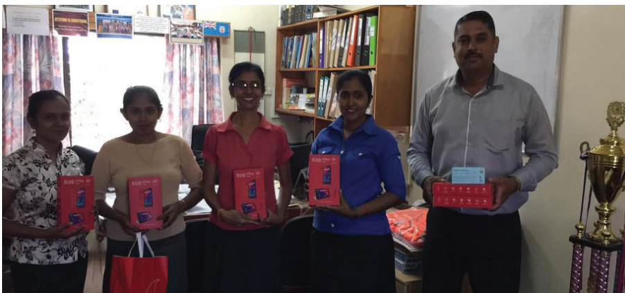
EDUCATION PACKAGE: Penang Sangam High Principal and staff with their technology package. The Foundation is supporting schools in Fiji with equipment to enable eLearning.