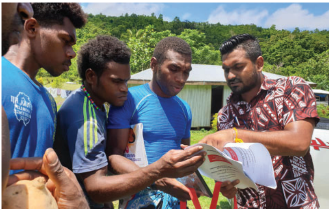
SOVUSOVU VILLAGE YOUTH CLUB. Handing over $2.5k grant for yagona, dalu and vegetable farming. The funding will help the youth generate income and scale up their micro business. The Foundation also shared mWellness Package.