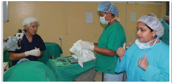
Foundation representatives eyewitness the surgeries in Labasa