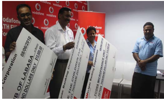
NGOs receive Red Alert funding for Cyclone Tomas disaster relief

This donation will aid Save the Children Fiji in supporting children and families adversely affected by