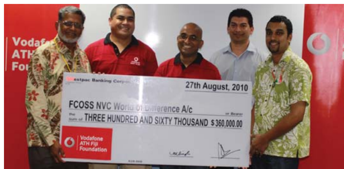
Vodafone Fiji executives present the $360k cheque

The Vodafone ATH Fiji Foundation ran awareness campaigns earlier in the year in the Central Eastern, Northern and Western Divisions followed by a call for applications from interested