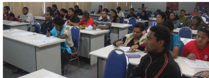
Volunteers in training

Participants in the workshop learn how to develop a structured CV and covering letter that was in line with their qualification and experience and heard about the avenues to job searching, basic knowledge of