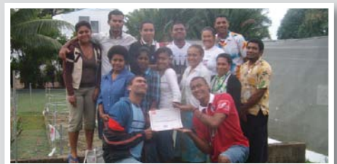
Volunteers in training

One couple, being a retired school teacher previously trained by the Virtues Project in schools, have given their time and transport to reach the more remote areas of the Ba Province. It is their objective to ensure that all the people in one entire tikina from the Turaga ni Koros through to the heads of the Mataqali use the five strategies of the Virtues Project to improve the lives of