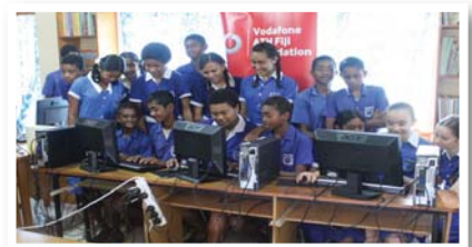
New computers at Khamendra Bhartiya

Some schools have also started running computer classes for seniors to make maximum use of the facility.