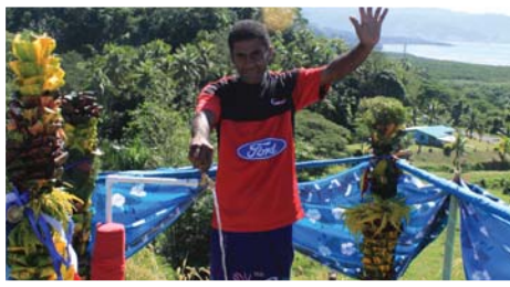
Commissioning of the water facility at Tokio

have more hearty stories to tell us on how they have been struggling without easy access to water which is our most essential daily need. The importance of water can be felt by those who have directly experienced not being able to access the water in the right quantity, at the right place and in time", she said.