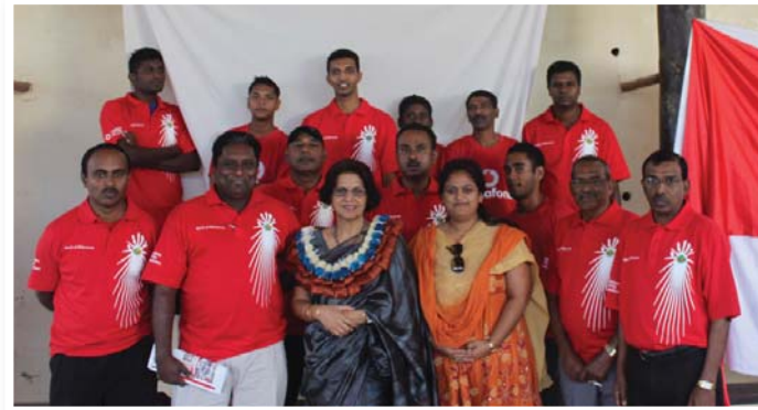
Foundation representatives with DEKC

The Kickers Club is a member the Nausori Crime Free committee [Black Zone]. Its foray into community work was launched in January, 2010 with