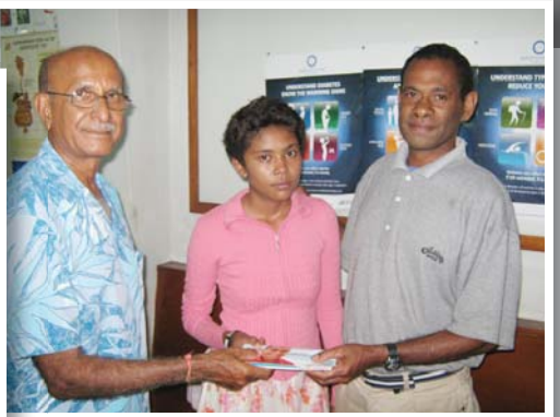
Children receive air tickets for India