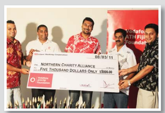
NCA executives receive the $5000 grant

The NCA recently received a $5000 grant from the Foundation. Donations amounting to $4000 were given by the corporate organisations during the seminar.