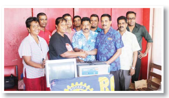
Labasa Rotary Club members donate computer to Rabi women