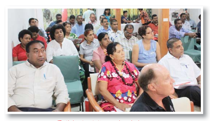
Participants at the seminar in Labasa

"Everyone can contribute and make things better. Vanua Levu is full of