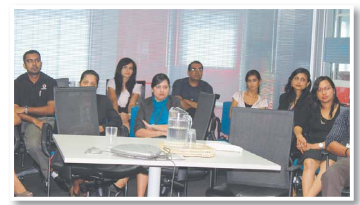
Vodafone staff attend a health and wellness symposium

comprising of professionals, oversees the operation of the mHealth service.