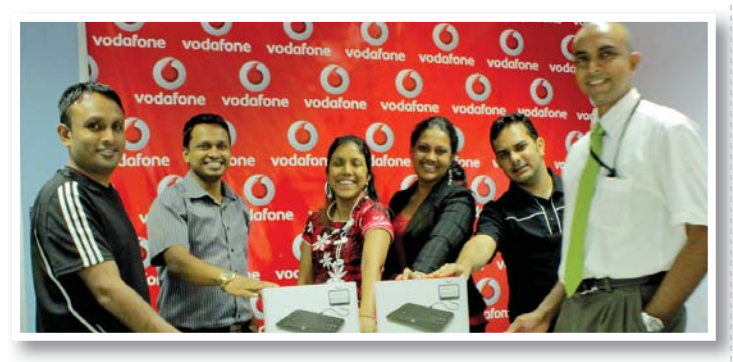
The newly formed mEducation Committee

It's another breakthrough for the Foundation's Mobile for Good Programme - the first step towards mEducation has been taken.